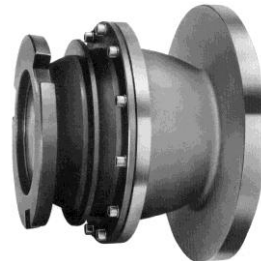
100mm Adapter Flanged Inlet