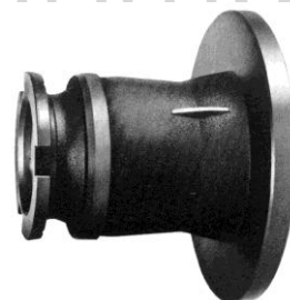
80mm Adapter Flanged Inlet