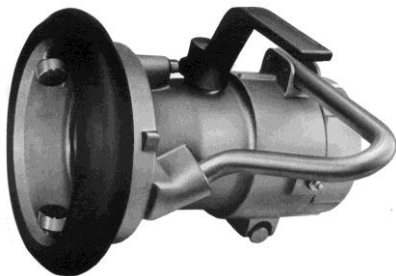
100mm Coupling BSP Female Inlet

Important: Never operate lever or valve without the male piece being inserted correctly.