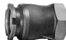
80mm or 50mm Adapter, BSP Female Inlet